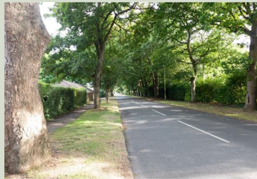
<The Drive - street scene>

NB Friends of Brandy Hole Copse needs volunteers