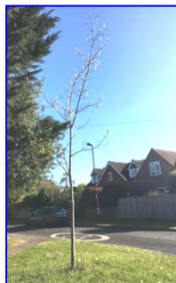
A fairly newly planted Oak tree →