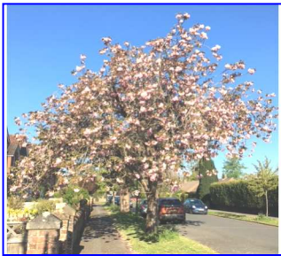
Cherry tree in full bloom in Highland Road ←

Let us get the next generation involved in tree planting.